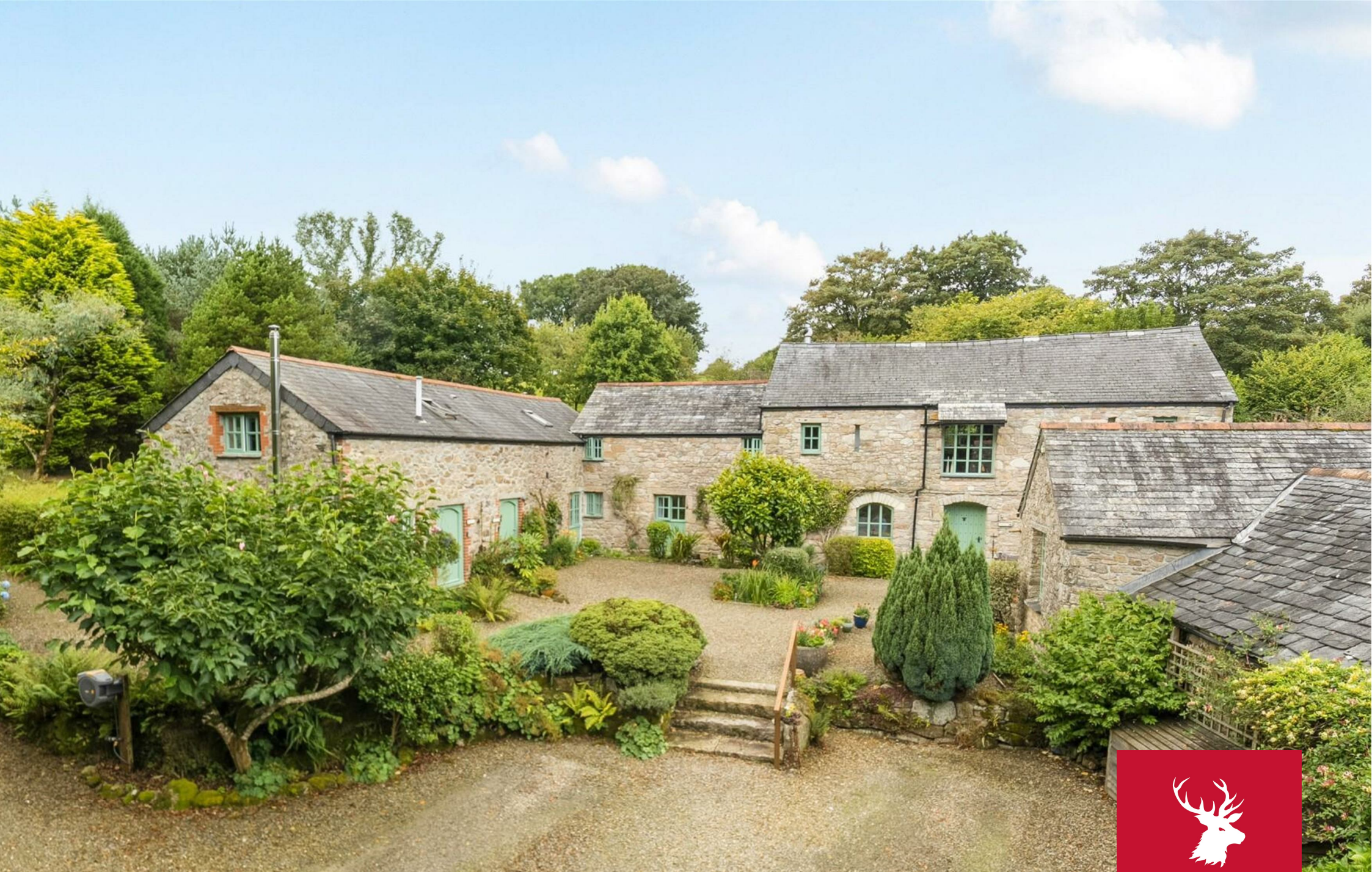
Badgers Sett Holiday Cottages